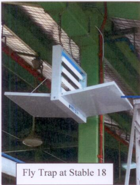
Fly Trap at Stable 18

Initial Pictures of sticky pads upon installation: