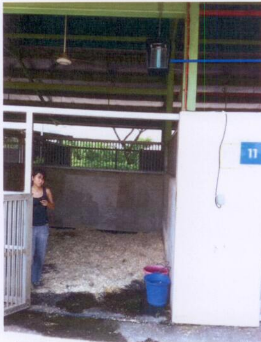
Bug Zapper Lantern at Stable 10