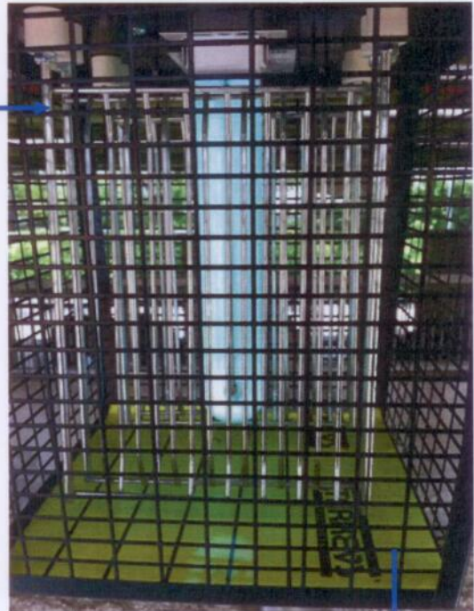
Sticky Pad at beginning.

The 1 st assessment is done 2 weeks later on the 1 st Aug 2012 with the sticky pads of the Fly Trap 60 as below: