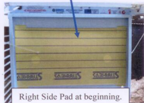
Right Side Pad at beginning.