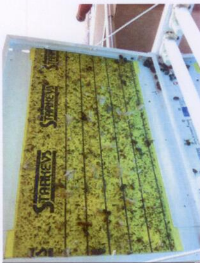
Left Side Pad after 2 weeks.

The 1 st assessment is done 2 weeks later on the 1 st Aug 2012 with the sticky pads of the Fly Trap 60 as below: