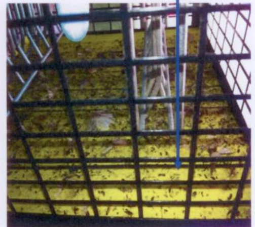
Sticky Pad of Bug Zapper Lantern after 2 weeks.