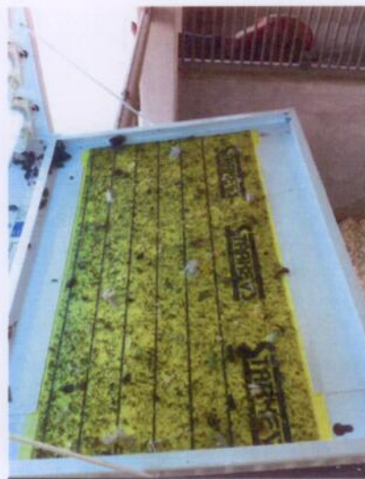
Right Side Pad after 2 weeks.